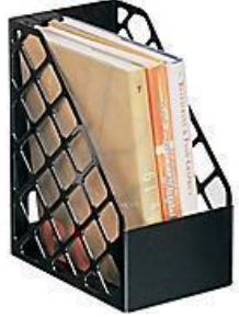
Black plastic magazine holder