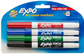
Package of four thin dry-erase markers